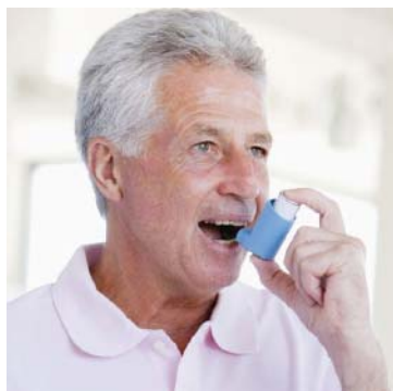
Ask about the right way to use the inhaler.